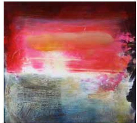
The texture of water, 12x12, acrylic/canvas, 2011